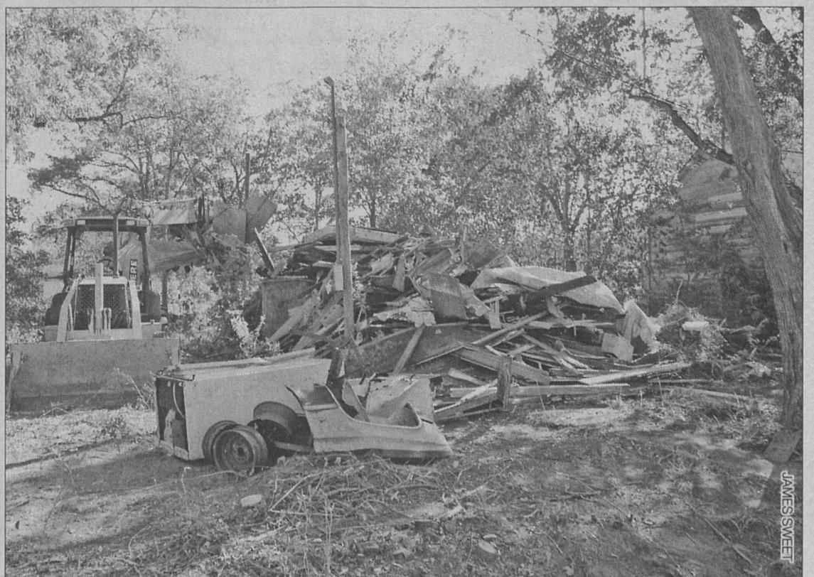
City workers demolished a condemned house at 816 East "C" Street last Thursday morning as part of an ongoing effort to clean up dilapidated properties. A picture of the property before demolition can be seen on page 10.